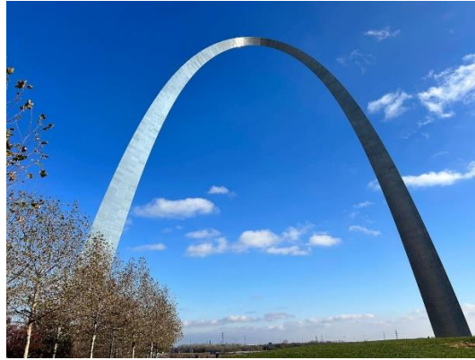
Figure 2: Known as the "Gateway to the West" the St. Louis Arch has become a symbol that celebrates the diversity that is so integral to the region and to the entire country.

Conference Submissions: Formal Papers, full panels, skills-based workshops, or other creative session formats should be submitted using the form found here (LINK) .